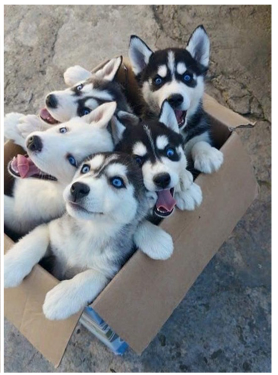
"This is MY child and I definitely want custody!"