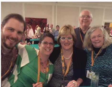
Bar Leaders' Conference